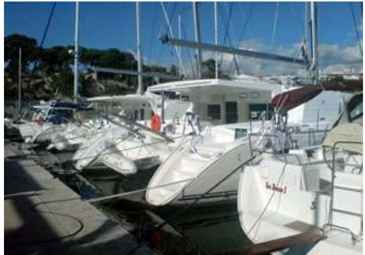
Inventory list: LAGON 500 (2006)